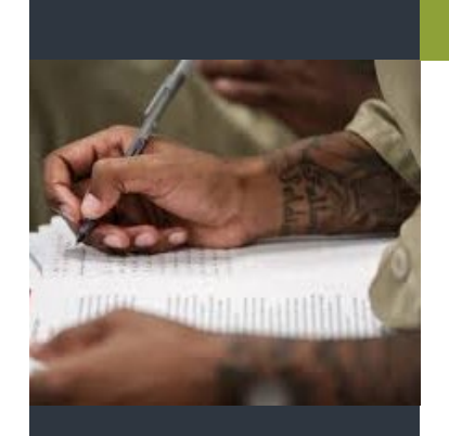
Habakkuk 2:2 ESV

And the LORD answered me: "Write the vision; make it plain on tablets, so he may run who reads it.