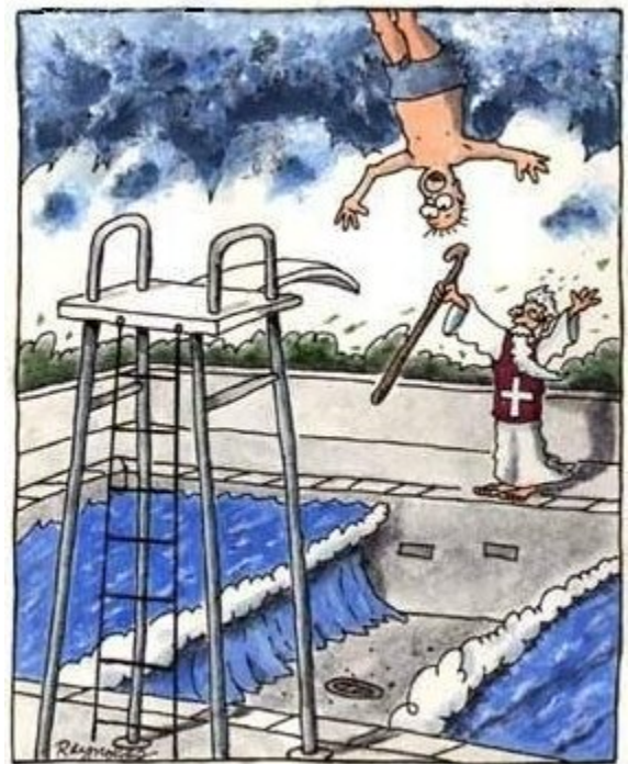
Moses' first and last day as a lifeguard.