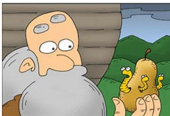
WE WERE TOLD YOU WERE TAKING CREATURES THAT CAME TO YOU IN PEARS