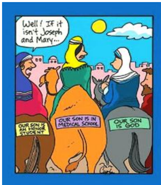
When Someone Doesn't Capitalize The G In God.